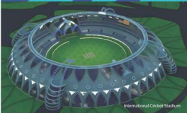
International Cricket Stadium