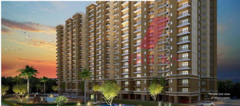
Perspective view of Waterscapes

Waterscapes. Premium homes amidst an oasis of peaceful living.