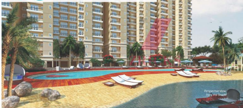
Perspective View from the Beach

At Waterscapes, every weekend could well be a beach holiday!